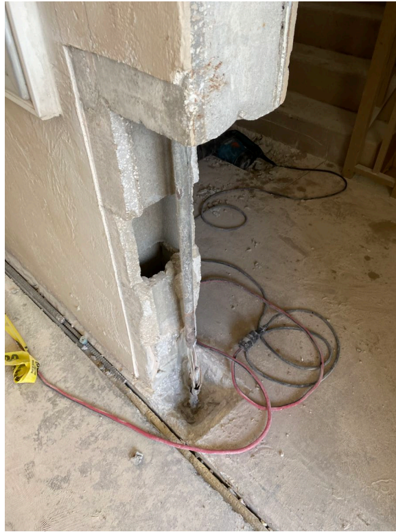
Picture 5: Corroded electrical conduits found in stairwell door jamb on the 7 th floor